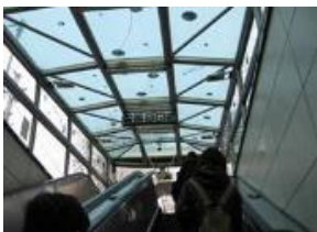
Hyehwa Station Exit #1