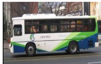
SKKU Shuttle Bus