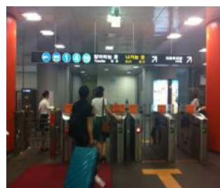
Arrival Gate at Seoul Station