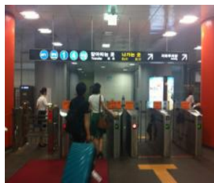
Arrival Gate at Seoul Station