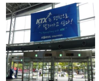
Seoul Station Lobby