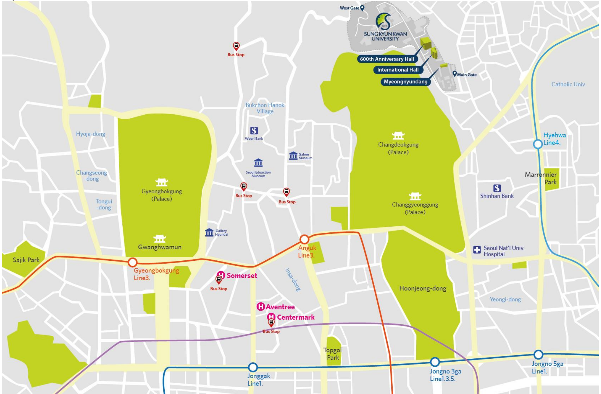
Map of Conference Venue and Hotels