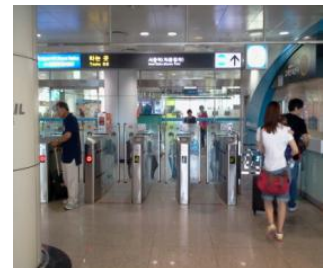
Departure Gate of Airport Railroad