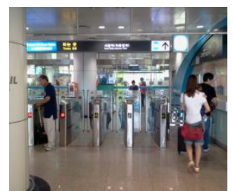
Departure Gate of Airport Railroad