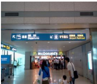
Arrival Gate (1F) at Incheon Int'l Airport

- Step-by-Step Instruction for Arriving at Seoul Station -