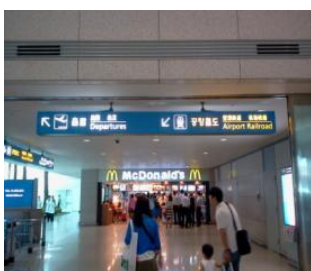
Arrival Gate (1F) at Incheon Int'l Airport