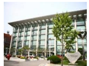
600 th Anniversary Hall