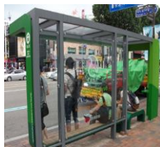
SKKU Bus Stop