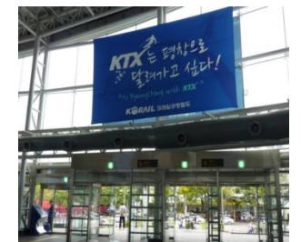
Seoul Station Lobby